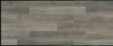
5023 Jennings 7" x 48"