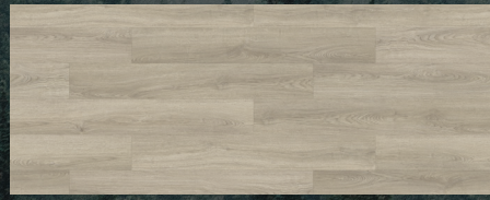
5013 Gladwin 7" x 48"