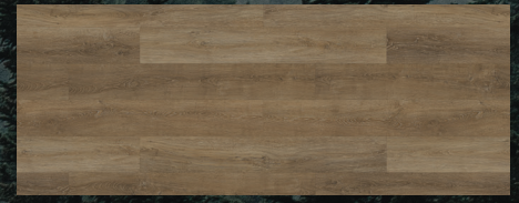
5022 Independence 7" x 48"