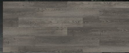
5095 North Fork 7" x 48"