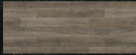
5021 Hawkins 7" x 48"