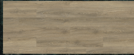
5012 Finley 7" x 48"