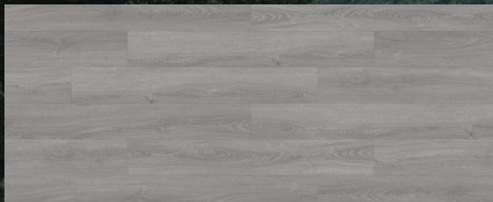
5011 Elsy 7" x 48"