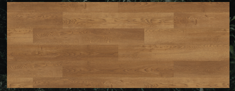
5092 Mozer 7" x 48"