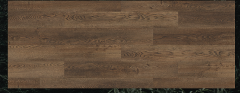
5091 Kessner 7" x 48"